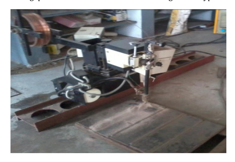
Fig:2 ESAB Submerged Arc Welding Machine

The equipment is conducted on ESAB submerged arc-welding equipment.EH-14, 2. 4mm diameters of welding rods are used. SA-516 Gr-70 steel plates of 500mm× 150mm×12mm size are selected as a working material and bead on joint with single V butt joint with 0.5–1mm root gap is consider. Flux: ADOR make F7P2 granular type is used.