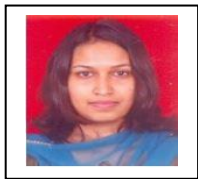
2 Asst. professor, Department of civil engineering, Dr. D.Y. Patil Institute of Technology, Pune, MH, India