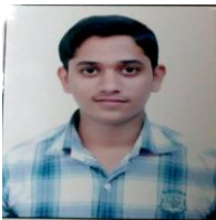
1 PG student, Department of civil engineering, Dr. D.Y. Patil Institute of Technology, Pune, MH, India