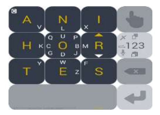
Fig-3.4: MessagEase's Letter Assignment [12]

Fig-3.4 shows the design of MessagEase onscreen keyboard. In this layout, there are 14 buttons in total. In Easy Swipe Keyboard, we placed only 8 functional buttons using same screen space. Easy Swipe Keyboard has a better key/button width (10mm) than MessagEase (6mm) [3]. While placing the letters in the button, only letter frequency data is used. They divided the 26 English letters in 3 groups. Most frequently used 9 letters were first placed in 9 central positions. Next 8 were placed on the side of one of the peripheral keys closer to the central key. Next 8 letters are assigned to the peripheral positions of the center key. At last, 'z' is placed beside 'e'.