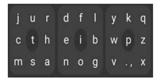
Fig-3.1: Distribution of Letters, Full stop and Comma

Our main concern was to place the 26 English letters (a-z / A-Z) and mostly used punctuation characters in a systematic way. Among the 8 buttons, 3 are rectangular shaped. In the center of those rectangular buttons, we placed't', 'i', and 'p'. While placing them we considered top 50 bigrams (frequently used character pairs) in English Alphabet [4]. Single click on these three buttons will make the corresponding alphabets visible on the screen. Up to this, all measurements are done based on letter frequency and top 50 bigrams in English Language.