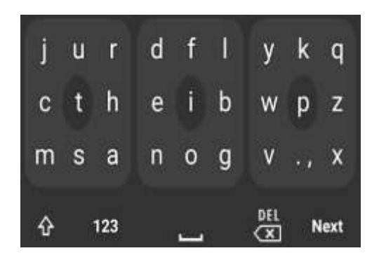
Fig-3.3: Final Layout of Easy Swipe Keyboard

Fig-3.4 shows the design of MessagEase onscreen keyboard. In this layout, there are 14 buttons in total. In Easy Swipe Keyboard, we placed only 8 functional buttons using same screen space. Easy Swipe Keyboard has a better key/button width (10mm) than MessagEase (6mm) [3]. While placing the letters in the button, only letter frequency data is used. They divided the 26 English letters in 3 groups. Most frequently used 9 letters were first placed in 9 central positions. Next 8 were placed on the side of one of the peripheral keys closer to the central key. Next 8 letters are assigned to the peripheral positions of the center key. At last, 'z' is placed beside 'e'.