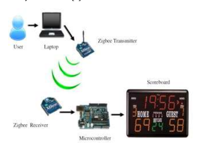
Figure 4. Conceptual Diagram.

Mervyn Siegfred R 2012. The device included in its hardware are the following: (1) a simple wireless communication module to pair up or establish a connection; and (2) the touch screen provides an effortless way of using the GUI software; (3) The device is powered by the USB port of a computer. The design software has the following functions: (1) it can be configured to be used with different official rules of basketball; (2) Easy to understand design of user interface; (3) easy to edit of human errors; (4) it provides the required data to be transmitted through Zigbee; and (5) There is buttons for specific task to perform and genrate appropriate data bytes to be sent[7].