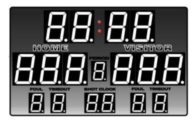
Figure 1. Scoreboard Display.

quarter and time outs as arranged in the said figure. The topmost display is the game clock which shows the remaining time per quarter [7].