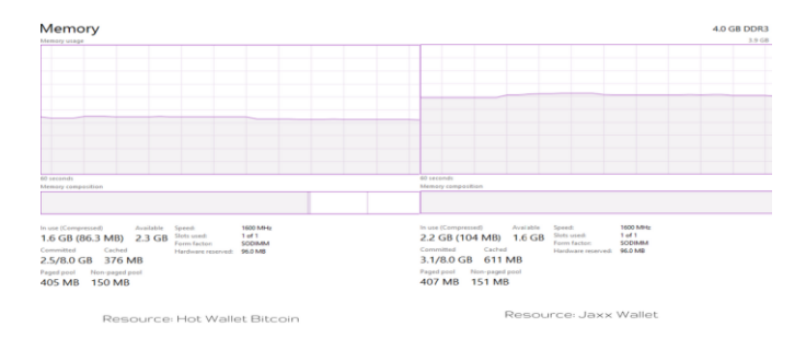
Fig - 3: Memory Usage of Hot Wallet for Bitcoin and Jaxx Wallet

Figure 2 shows the graphical representation of the CPU usage of hot wallet for bitcoin and Jaxx an existing desktop wallet. According to analyzed survey our wallet uses very less CPU power and it works smoothly on any Linux Distro flavors. From the above graph it can be inferred that the our project uses very less CPU compared to Jaxx Wallet