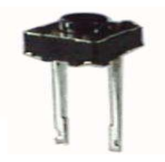
Fig 4: Switch

A switch is used as a human machine interface and is used to give input to the Micro-controller unit. A particular task can be performed by pressing a particular switch so micro-controller when senses that a switch is pressed then it performs the task corresponding to that switch.