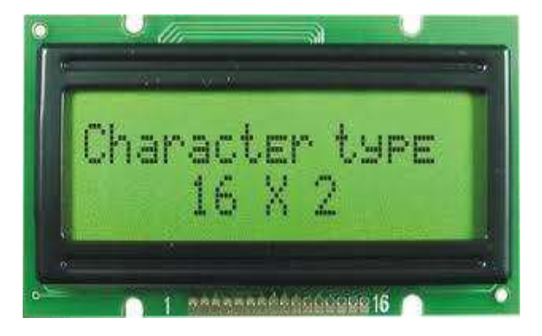
Fig 5: LCD

It can display 32 characters at a time on the display. There are two rows (lines) and 16 characters can be displayed in each line. And it will be used in 8 bit mode i.e. its 8-bit data bus will be used to transfer the data codes from MCU to LCD.