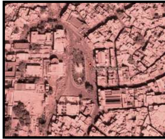
FIG2: (Maharaj bada)

It is one of the prime or important markets of Gwalior, as well as Madhya Pradesh. There are several big markets located at Maharaj Bada, like Sarafa Bazaar, Topi Bazaar, Subhash Market, Nazarbagh Market, Gandhi Market, Daulat Ganj etc. Each market has his own significant value. Apart from these big markets, there are several small markets around the Maharaj Bada area. There is a beautiful garden at large chowk, having statue of Maharaj Jivaji Rao, in the centre of it.