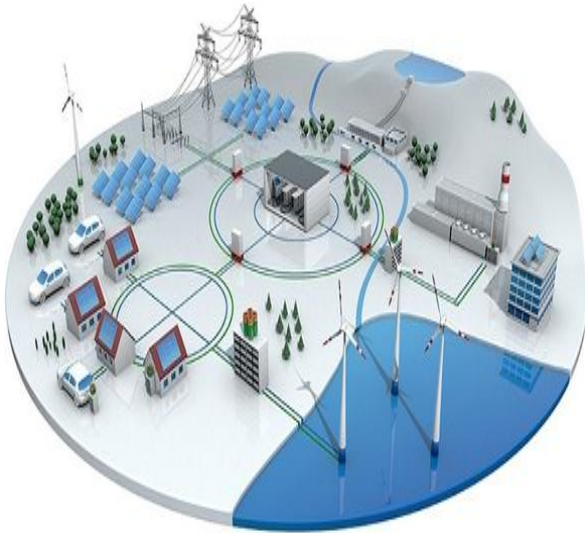
Figure2: Sensors used In IOT Technology

This type of engagement is already playing a greater role in shaping products and services. The smart aspects of our lives will contain a greater element of pull, rather than the push that has been the de facto approach to date. Smart sensors and services need to be insight-driven, prototype-powered, and foresight-inspired, particularly in the domains discussed in this book, as they have direct and tangible connection to human end users. It is important to maintain the balance requirements between the creative and analytical processes. We must ensure that needs are identified and appropriate insights collected to realize the opportunities in a way that makes sense from the perspectives of customers, science, engineering, and economics.