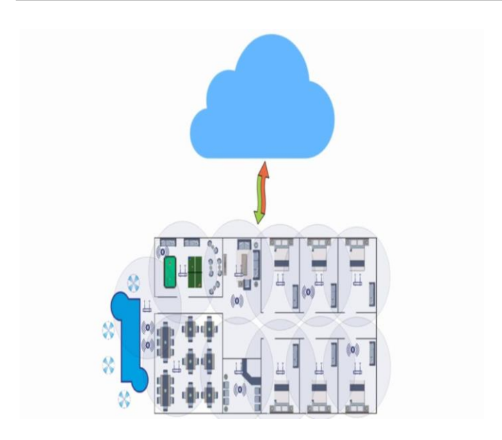
Fig -1: Indoor Tracking System

Volume: 05 Issue: 09 | Sep 2018 www.iriet.net p-ISSN: 2395-0072