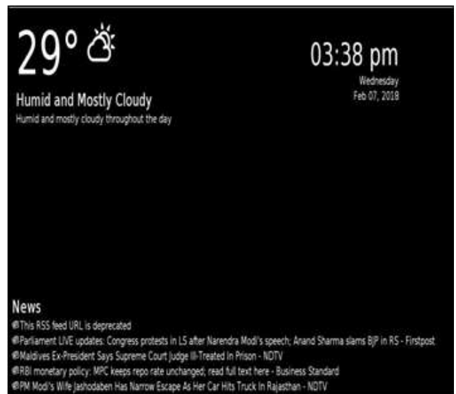
magic mirror ui

The proposed Magic Mirror represents a natural interface that provides a platform to access information and data services in a more personalized manner. This project is aimed at contributing to the design and implementation of a Magic Mirror-like interface as well as the automated home environment where user can interact with the mirror interface, we briefly comment on some related work and research in similar direction. It basically aimed at providing a platform that can facilitate the development of smart mirror. It acts an alternative option than the sandbox environment. It is light in functioning as compared to already present platforms. Its major advantage is its multiple language and environment support so as to ease end user efforts. Another project named Magic Mirror[10] as carried out by students of NUS, they created a magic mirror which can recommend you appropriate clothing in the morning while you get ready. The Magic mirror model will scan the user and then based on the particular occasion or event it will recommend most suitable attire and other styling options. The events can be retrieved from user’s social media account or can be added to the calendar manually.