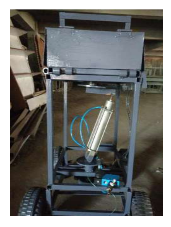
Figure 1: Three Axes Pneumatic Advance Trailer

It is mainly based on rotation of tipper trolley and divided in two parts Rotation and Dumping. For rotation of tipper, we used worm and gear mechanism. Worm is directly coupled with electric motor which is at horizontal position. On the lower side of dumper, the spur gears are meshed with worm wheel and the axis of rotation of spur gear is vertical, which is directly attached to tipper trolley. The power supply is provided to the electric motor by using Double Pole Double Throw switch to complete the circuit of battery and motor. As a motor start rotating the worm is also rotated at same speed and spur gear which is connected to worm wheel. The vertical shaft which is connected directly to the center of tipper trolley, when worm complete its 1 rotation then 1 teeth of worm gear moves forward. Spur gear is having 40 teeth on its profile. When 10 teeth of spur gear are moved forward then trolley gets rotated by 900 from its initial position in 20 second. The rotating direction of trolley is changed or reversed by Double Pole Double Throw switch. When the trolley completes its required angle then material is dumped with the help of pneumatic cylinder. The compressed air is supplied by air compressor to cylinder.