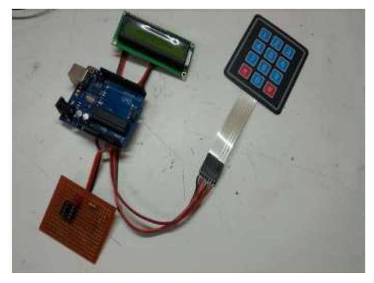
Fig -2: Hardware components of project

This Fig no 1 shows the how we are creating the circuit of our project. Due to which overall project will be run. By using this way we are use the pins of components. There is separate power supply is connected of 5v.by using this circuit we run this project.