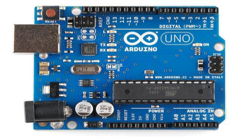
Fig 1.2 Arduino

Arduino is a open source hardware and software it is a single board microcontroller, intended to make the application of interactive objects or environment more accessible under which the programming language will be more simple. This contains onboard power supply, USB port to communicate with PC. It will perform multiple function by providing multiple input and output. Here, Arduino is used to gather the image captured by the camera and analyse it within it with the help of image processing techniques. Arduino plays an vital role thus the operation of image processing techniques are controlled here. It is more preferable compared to microcontroller because microcontroller will give only one output at a time but arduino will perform multiple tasks.