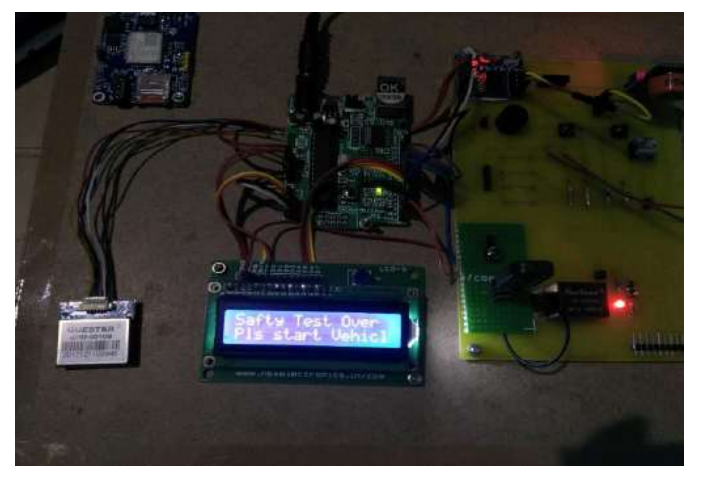
Fig -6: safety test completed.