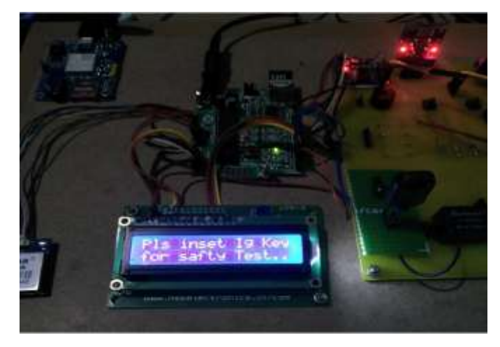
Fig -4: Ignition key test.