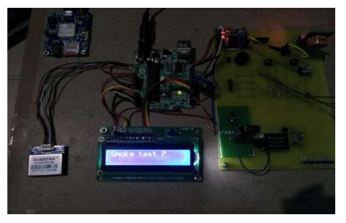
Fig -6: Smoke test