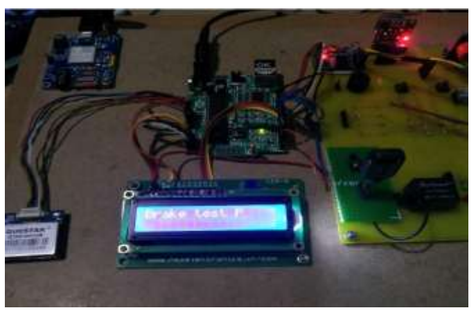
Fig -5: Brake condition test.