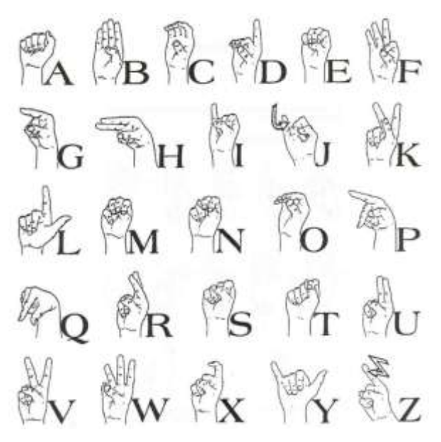
Fig 1 : Sign language for Alphabets