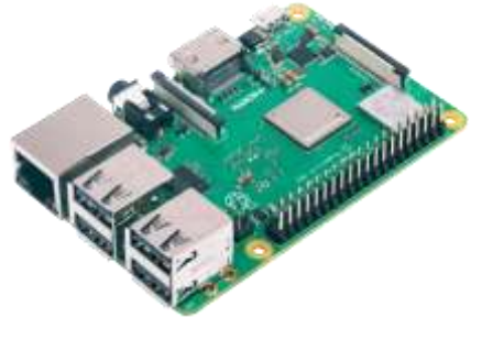
Fig 3 : Raspberry Pi

The Raspberry Pi is a low-cost credit-card sized singleboard computer. The Raspberry Pi was created in the UK by the Raspberry Pi Foundation. The Raspberry Pi Foundation's goal is to "advance the education of adults and children, particularly in the field of computers, computer science and related subjects. Many people have used the Raspberry Pi to make like cameras, gaming machines, robots, web things servers and media centres. There are a few different versions of the Raspberry Pi, each made for different uses. All of the current versions use a microSD card for the operating system and file storage. They are powered by a micro-USB port, have one HDMI port, one audio/video jack socket, and a 40-pin GPIO connector.