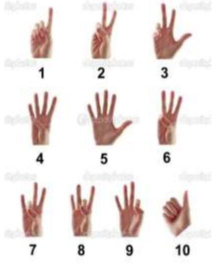
Fig 2 : Sign language for numeric