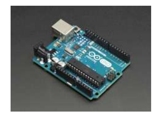
Fig 4 : Arduino Uno Board

Arduino is an open source computer hardware and software company, that designs and manufactures singleboard microcontrollers and microcontroller kits for building digital devices and interactive objects that can sense and control objects in the physical world. Arduino board designs use a variety of microprocessors and controllers.