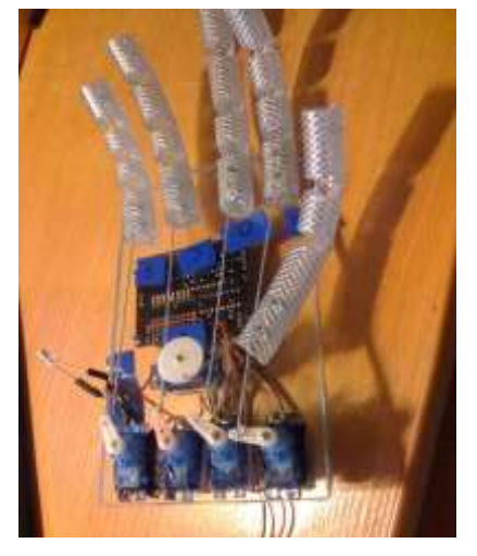
Fig 5: Mechanical arm using servos

arm is just one of many types of different mechanical arms.