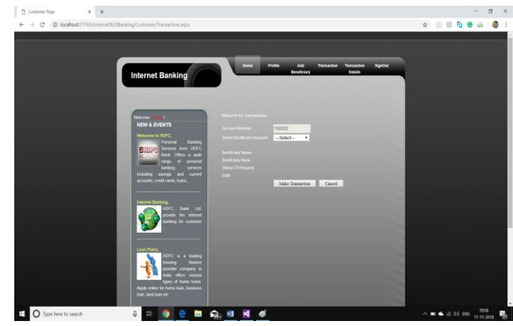
Fig 2.4 Funds Transaction Page

Description: In this page a user can add benefaction to their account.