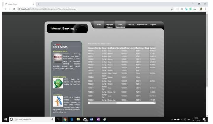
Fig 2.1 Transaction Page

Description: A employee can track the transactions of the users of their bank