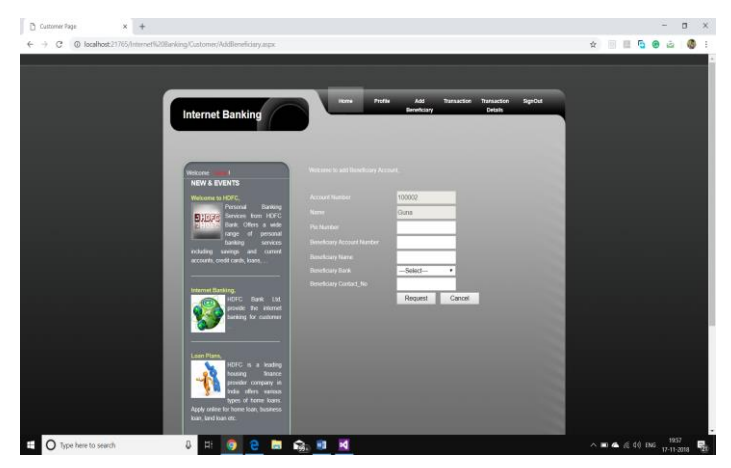
Fig 2.3 Beneficiary Page

Description: Admin only can access the log files using the decrypt key.