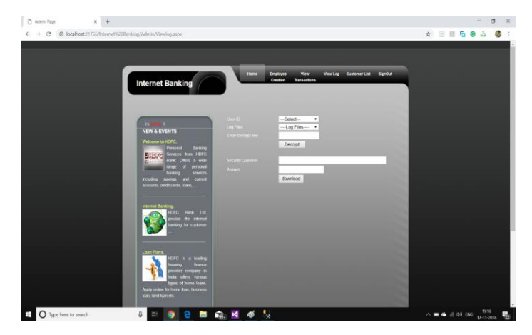
Fig 2.2 Log Management Page

Description: A employee can track the transactions of the users of their bank