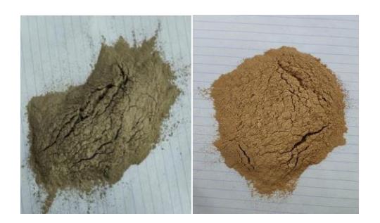
Fig. 4.1 Untreated Ash & 4.2 Treated ash