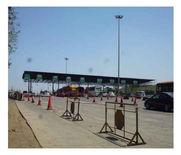
Fig -1: Khed-Shivapur Toll Plaza Showing Mixed Lanes

i. Mixed Lanes : Mixed lanes are the lanes at a toll plaza which allows both Manual tolling vehicles and automated tolling vehicles to pass through. At Khed-Shivapur toll plaza, all lanes are mixed lanes. This was the prime reasons causing delay of FASTag vehicles which increases the load on toll booths resulting in congestion. So it is essential to provide dedicated lane exclusive for FASTag vehicles.