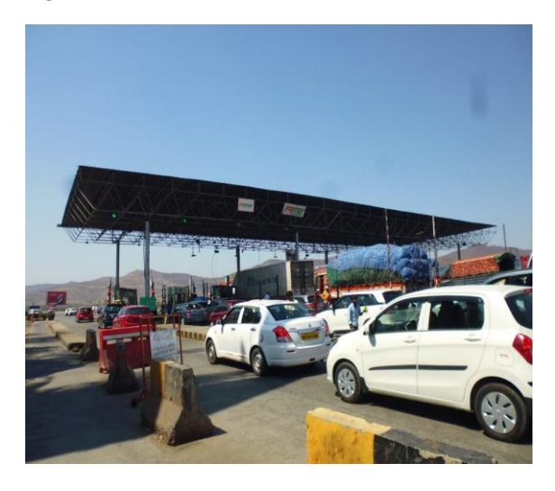
Fig -2: Lack of Display Boards at Khed-Shivapur Toll Plaza

ii. Lack of display boards : Vehicles which travels at high speed approaching at the toll plaza, it is not possible for a short distance to switch the lanes at that speed. National Highway 48 is a six-lane divided Highway and vehicles travel in all three lanes with a speed limit of 80 KMPH. Such huge speed causes problem to change the lane rapidly, this results in vehicles entering the wrong lane which is not allocated for them. This may look like a small issue but during peak hours it is a concerning congestion causing factor.