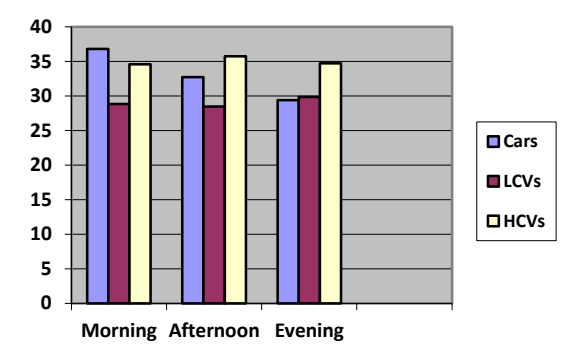
Chart -1: Average Duration as Per Type of Vehicle

provided with more exclusive lanes than others and provisions should be improved.