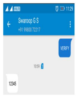
Fig-4: Verification page through OTP

© 2019, IRIET Impact Factor value: 7.34 ISO 9001:2008 Certified Journal