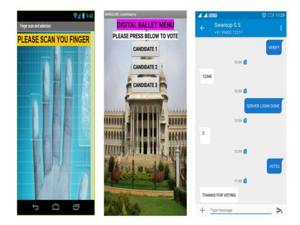
Fig-6: Region wise voting list (Bengaluru)