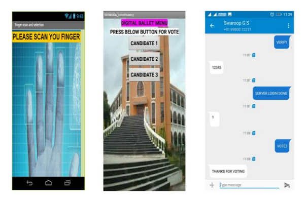
Fig-5: Region wise voting list (Shivamogga)