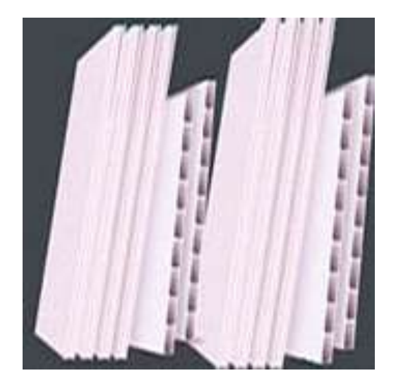
Fig.01 GFRG Panel