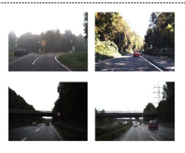
Fig 1: Example images from GTSDB and GTSRB database

The development of the technology level of the latest mobile processors enabled many vehicle producers to install computer vision systems for their customer's cars. These systems will significantly improve safety and realize an important step towards driving. Among other tasks solved in computer vision, the problem of traffic sign recognition (TSR) is the most well-known and widely discussed by many researchers, however, as the main problem is the low detection accuracy of the system high demand hardware computing. They do not have a system of classification of traffic signs. Recognition of traffic signs is usually solved in two steps: localization and subsequent classification. The different type of localization methods is available. Effective implementation of image preprocessing and localization algorithm of traffic signs performed in real time. In the classification stage, a simple template matching algorithm is used. The Fig 1 shows the images of GTSDB and GTSRB. The datasets from GTSDB and GTSRB is used for train and test the developed algorithm.