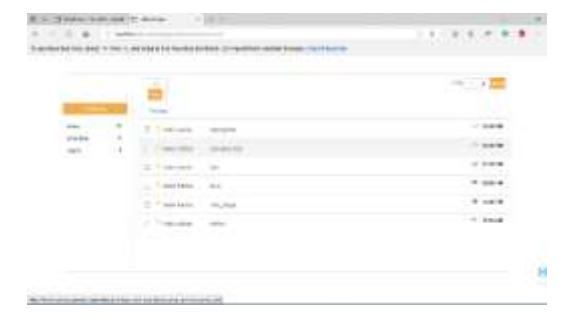
SCREENSHOT 3:SENT MAIL