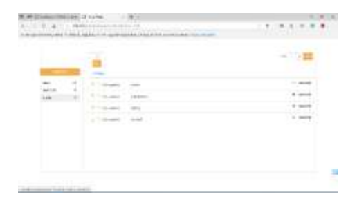
SCREENSHOT 4:DRAFT PAGE

• Draft page helps the user to view all the mails saved by the user, in a framework which is similar to that of a Gmail. The screenshot 4 shows all the mails that are being retrieved through the IMAP search function from the Gmail server.