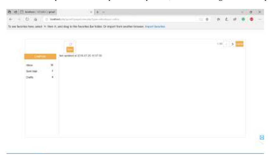
SCREENHOT 6:additional feature of compose mail

• This is the feature used to update new incoming mails. If there are more mails after the previous update. But if there is no update after the previous updates, then a message will be displayed on your screen.