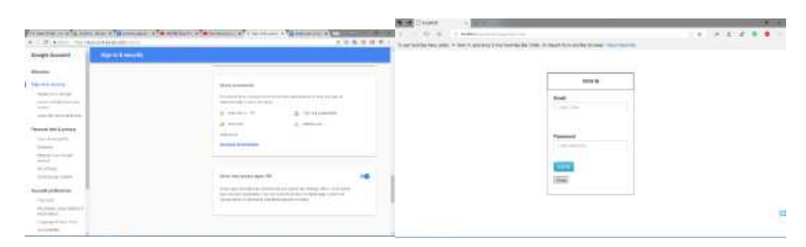
SCREENSHOT1:SIGN UP PAGE