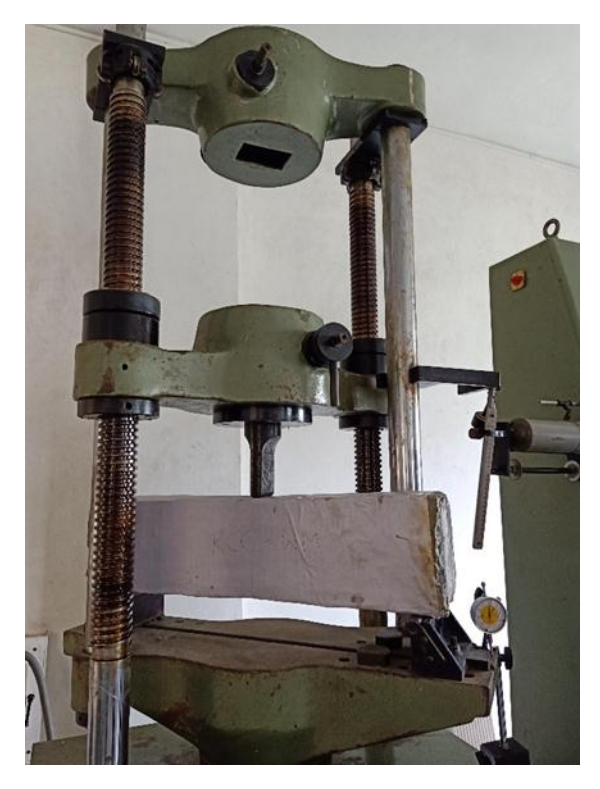
Fig. 4 Test on RCC beam with steel weld mesh and PVC flex banner

In all these tests no delamination of flex banner was observed, and the adhesive worked perfectly. The tile adhesive used to bond the weld mesh with the RCC beam also worked perfectly without any slip or delamination or failure.