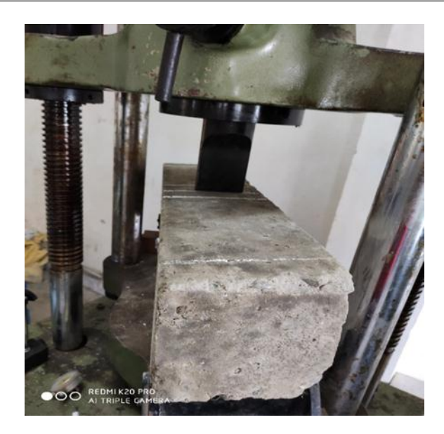
Fig. 3 Test on RCC plain beam

On 3 RCC beam specimens, waste PVC flex banners are wrapped and pasted. These are named as RCC_Flex beams. Table 3 shows result of flexure test on these beams.