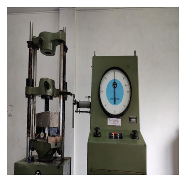
Fig. 2 Universal Testing Machine - test setup

4.4 Flexure Test – Flexure test is conducted to find out flexure load capacities of the RCC beams. The test is conducted on the Universal Testing Machine (UTM) under center point loading, on the same lines at which the flexure test is conducted for unreinforced concrete beams (AASHTO T-177 or ASTM C293).