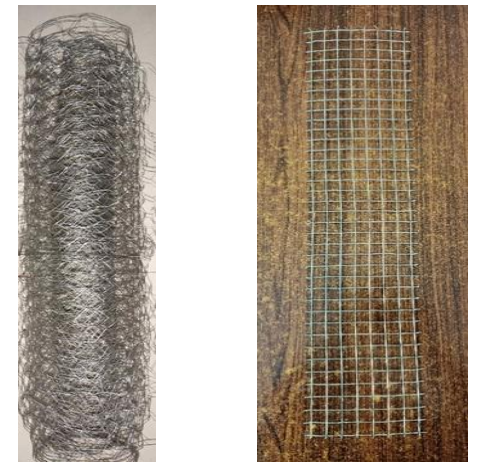
Fig. 1 Steel Chicken Mesh and Weld Mesh used in the study

3.8 Steel Weld Mesh – Steel Weld mesh is a series of parallel longitudinal steel wires which are welded to cross steel wires by electric fusion method with proper spacing between them. In this experiment steel weld mesh is used as strengthening reinforcement and it is fixed on all the 4 sides of the beams with tile adhesive. Weld mesh with steel wires of thickness 1.35 mm and placed at 16 mm center to center both ways is used.