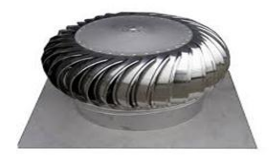
Fig-2 roof top wind turbine ventilator