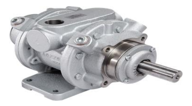
Fig-9 Air motor

A pneumatic motor is a mechanism by which compressed air is taken and converted into energy that is then used for mechanical work. Pneumatic motors are also capable of rotating motion in addition to linear motion.