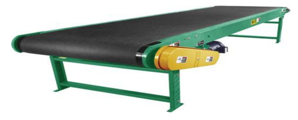
Fig-10 Belt conveyor system