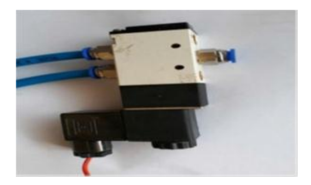
Fig-8 Solenoid valve

Solenoid valve is a control device that either shuts down or makes fluid flow once electrically energized or de energized. The actuator is an electromagnet in the shape. Once energized, a magnetic field builds up that pushes against the movement of a spring a plunger or pivoting armature.