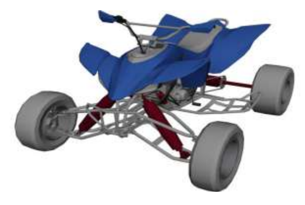
Fig. 1-Conceptual Diagram of ATV Bike

The chassis of the automobile generally refers to the lower body of the vehicle including the tires, engine, frame, driveline and suspension. The frame provides necessary support to the components to be placed on it. The frame should be strong so it can withstand to absorb twist, shock, various stresses and the vibration. So the stress analysis of the chassis to locate the critical points is to be done by Finite Element Analysis (FEA). This critical point is the actual causes of the fatigue failure. So as we do the analysis of the chassis it should predict the life span and reliability of the chassis. So every idea has an inception and with proper incubation it results in an accomplishment. We realized that being near an industrial area like Talegaon MIDC, we can manufacture few of the customized components for our Quad bike. For the designing 3D part CATIA software is used and for simulation Ansys and Finite Element Analysis (FEA) software is used.