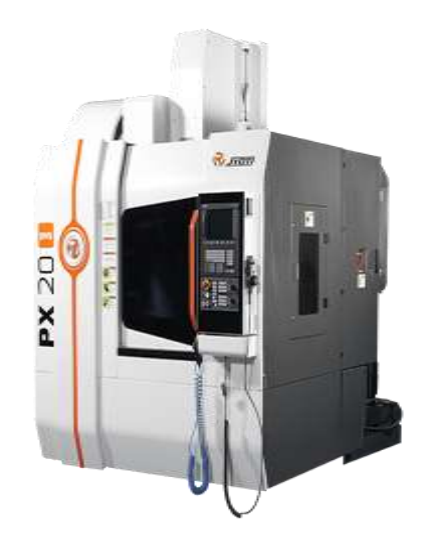
Fig 2: CNC Vertical Machining Center [11]

The coolant nozzle around periphery of spindle face facilitates the manual adjustment for proper positioning of the coolant on the job while machining. [11]