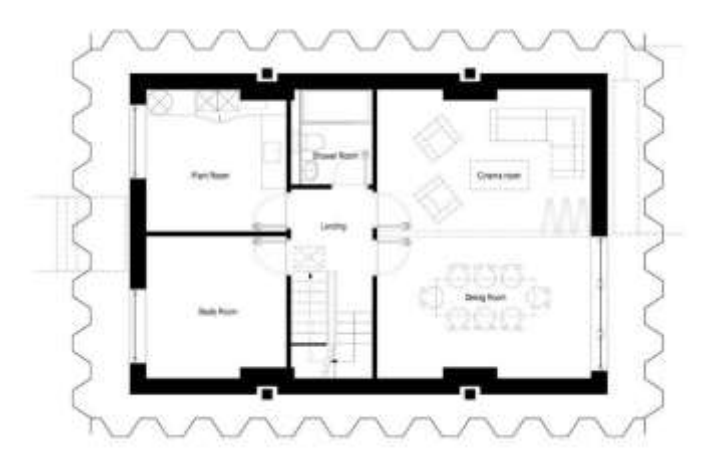
Fig - 3: Plan of the amphibious house

Roof light, Gulley and guidepost, Zinc rainskin cladding, Junction of foundation with guidepost, Wet clock access way, Foundation and guideposts and Timber with steel frames.