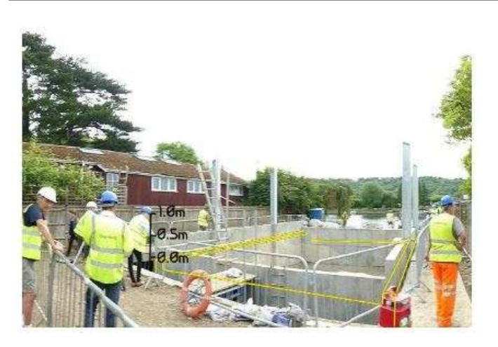
Fig - 4: Construction of amphibious house

International Research Journal of Engineering and Technology (IRJET) Volume: 06 Issue: 12 | Dec 2019 www.irjet.net