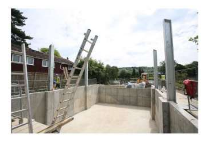
Fig – 5: Construction of amphibious house

The above Fig - 4 and Fig - 5 indicate the construction in process of the Amphibious House.