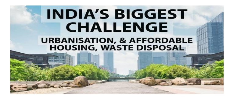
Fig-1: Major Problem of India

As shown in above figure, it is understandable that due to migration of people from rural area to urban area, the urban area became increasing gradually resulting in urbanization. Due to urbanization, there is the problem creates of providing house for everyone. And due to urbanization and migration, there is also increase in demand of people and also increase in waste disposal. Thus results into pollution.