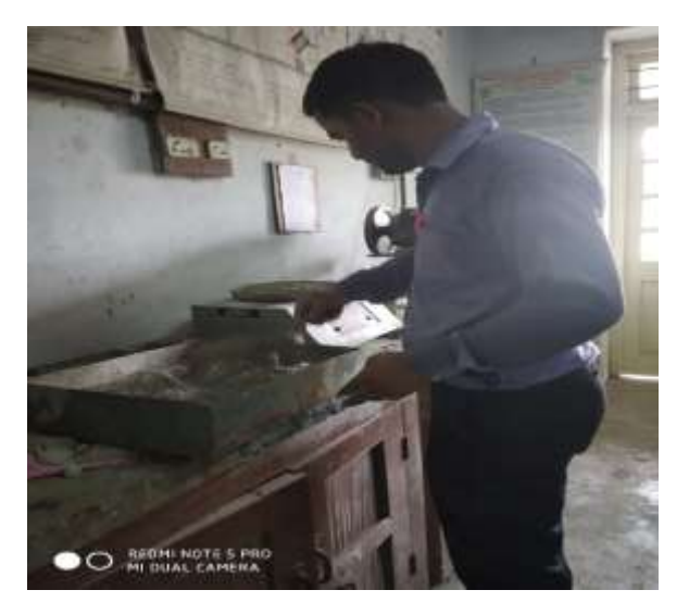
Fig. 1: Measurement of weight of different ingredient

Compressive strength of concrete was evaluated at age of 7 days, using standard cube specimens of 150 mm \times 150 mm \times 150 mm.