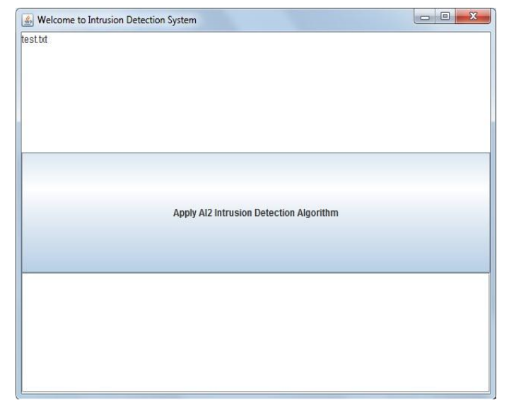
Fig.2: Home Screen

There is no such GUI for end users because it's of no use as the system is for administrative purpose. For understanding purpose we have provided a window with a single button. This is shown as below.