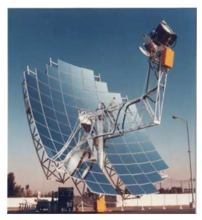
Fig 5 – Stirling engines for low-temperature solarthermal-electric power generation

Solar technologies is the most accessible green technology[10]. In this, from local people to commercial spaces use solar energy to reduce dependence on limited energy resources[10]. Of course the main source of solar technology is the Sun. In solar technology, solar power is used which is the conversion of energy from sunlight into electricity[11]. There are three basic main technologies by which solar energy is used: the first is PV i.e. photovoltaics, the second is CSP i.e. concentrated solar power and third one is SHC i.e. solar heating and cooling systems[12].