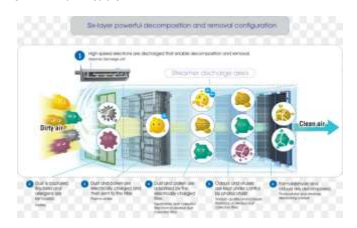
Fig 8 - Air purifiers technology

Air pollutions is the situation of air when characteristics of air are changed. When the air is polluted, it contains the pollutants such as dust, chlorofluorocarbons (CFC), ash, carbon dioxide, carbon monoxide, lead, etc. Air purification refers to the green technologies and production of plants which reduces CO_2 in environment and produces fresh air. To control the pollution of air there are many methods are available such as combustion, absorption, adsorption, mechanical devices, fabric filters, etc[2].