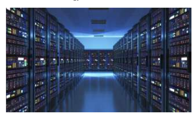
Fig 3 - Server Room

Many organizations and businesses require to store huge amount of data regularly [9]. For this purpose they need data centers or data servers to store the data. These data centers or servers require huge amount of energy. Also there is large amount of CO_2 emissions. Green technology suggests that we should provide the energy need of these data servers or data centers through natural resources like wind, solar, etc. Also suggest that data centers or servers should be developed in a way that require less amount of energy. We can also combine different data servers or centers as per our need. Therefore cooling system required for these data centers and data servers are also in small amount.