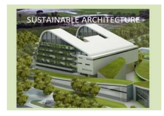
Fig 4 - Sustainable Architecture

Green Architecture is the environment friendly technology. This technology focuses on controlling urban resource use and making the urban expansion more sustainable[10]. This includes green buildings. These green buildings are constructed in a way that they use natural light. Also it is the implementation of design in structures, buildings and commercial space that are environment friendly and eco-friendly, environmentally accountable and resource efficient throughout the process of development of buildings from planning to actual use. Features of green architecture include use of materials form urban waste, reduces waste production and aiming zero levels of emissions, water waste, energy waste, etc.