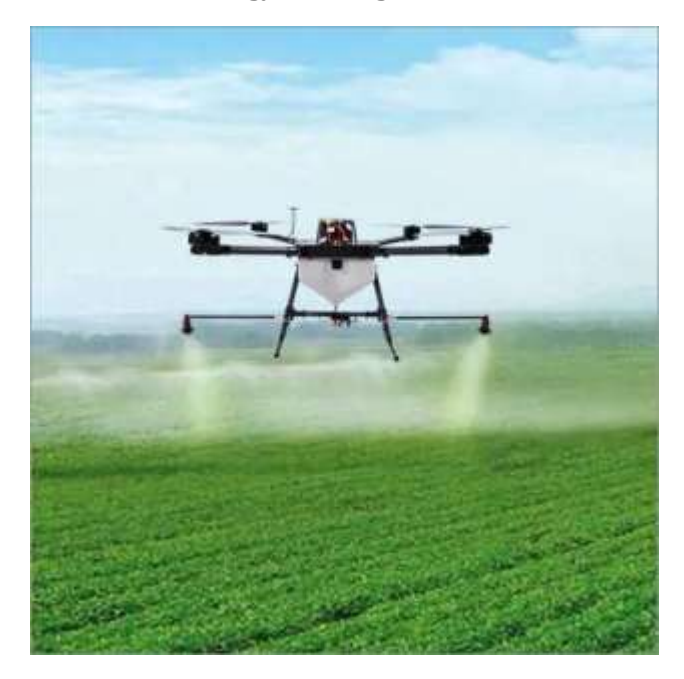
Fig 7 - Agriculture pesticide spraying drone

To satisfy the increasing global need for food, the agriculture field has to depend on advances in production techniques and expansion in production areas over the years. Huge amount of growth in population and increase in number of human activities resulted in exploitation of environment and threatened the capability of agriculture field to provide food and income for the people. Green technologies are the new emerging technologies which are contributing to the enhancement of economic and efficient production of safe and high quality food [14].