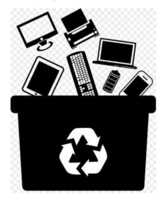
Fig 2 - Device Recycling