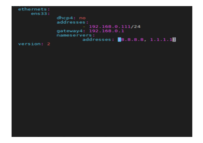
Fig - 2: Static IP Address

- /etc/netplan/50-cloud-init.yaml → name of the file (bare in mind that the name of the file may be a little bit different under some circumstances)