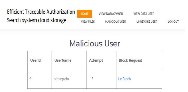
Fig -6: Malicious User unBlocking