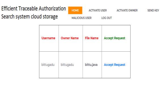
Fig -3: Sending keys