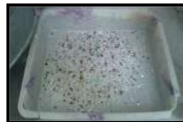
Fig - 2: Waste Glass