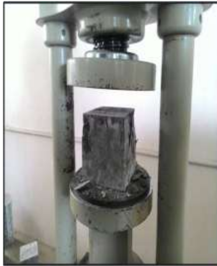
Fig -2: Testing of Cube

A – Surface area of cube under loading (mm 2 )