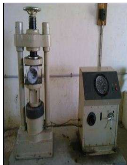
Fig -2: Testing of Cylinder

where, P – Applied load in N, D – Diameter of cylinder in mm, L – Length of cylinder in mm