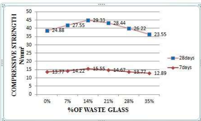
Chart -1: Compressive Strength of Cube