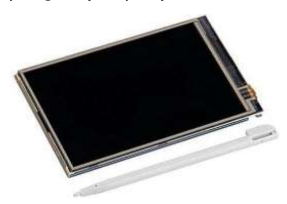
Fig.2.3 Touch Screen LCD

A touch screen is a display and input device which shows the content on the screen and user can also make changes. A user can give input or control the information processing system through simple or multi-touch gestures by touching the screen with a special stylus or one or more fingers. The user can use the touch screen to react to what is displayed and, if the software allows, controlling how it is displayed. In this project we built touch screen display on a Raspberry pi 3. Menu is displayed on a touch screen display along with quantity and price.