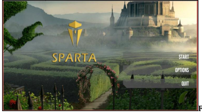
ig 1- Main Menu