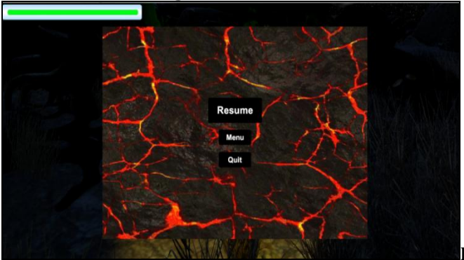
ig 2- Resume Menu