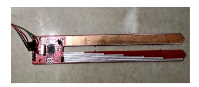
Fig. 3.1 Sensor module

It is necessary to control the pH of the water as any in the level may harm the organisms that changes depend on it. Different organisms flourish in modifying ranges of pH and can be greatly affected by even a small shift. A switch in natural pH in the water level can be evidence of increased pollution or other environmental circumstances. This is because of the fact that pH can be altered by chemicals substances in the water. The solubility and of chemical physiological availability the components of water are defined by pH.