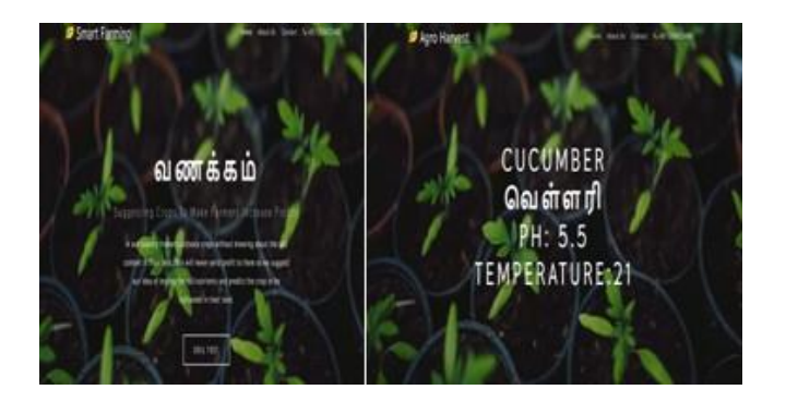
Fig. 4.3. A view of the client webpage that can get input from the server program and display output

earned by safely growing the crop that is meant to be grown on their soil. Most of the farmers, even today follow the same traditional techniques and rely on specific type of crop growing to make their ends meet and to also enjoy some profits not knowing properly whether the crop product will grow on their soil or not, and therefore this system can be viewed as a safe and small scale alternative for helping the farmers predetermining the crops that they can grow.