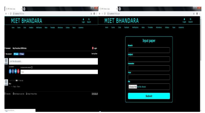
Fig. 3: Chat and paper upload module

The user should be able to register through the system by maintain the details required for registration. After registration the user can login into the system by providing the user id and password. This service is for both the staff and students; however both have different usage of the feature. Students - will be able to view the following information which is critical about the Assignment and Notes; the number of assignments given, Upon the analysis using this data, the system will inform the students if they have got the new assignments and notes uploaded by the faculties. Staff - will be able to upload the notes helpful for students and the new assignments using the mobile device.