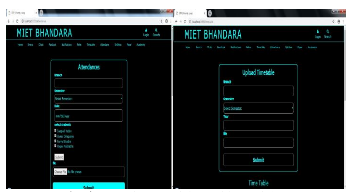
Fig. 4: Attendance and time table module

This module helps to keep the track on student's punctuality and regularity and time table module allows the students to view timetables and the faculty to upload the respective timetables as per their respective semesters.