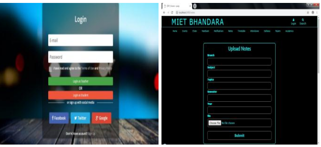
Fig. 2: Login and notes module

The user should be able to register through the system by maintain the details required for registration. After registration the user can login into the system by providing the user id and password. This service is for both the staff and students; however both have different usage of the feature. Students - will be able to view the following information which is critical about the Assignment and Notes; the number of assignments given, Upon the analysis using this data, the system will inform the students if they have got the new assignments and notes uploaded by the faculties. Staff - will be able to upload the notes helpful for students and the new assignments using the mobile device.