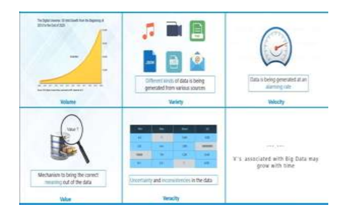
Fig -1: 5 V's of Big Data

Big data is data whose scale, distribution, diversity, and/or timeliness require the use of new technical architectures, analytics, and tools in order to enable insights that unlock new sources of business value. Four main features characterize big data: volume, variety, veracity velocity and value or the five V's. The volume of the data is its extent, and how huge it is. Velocity refers to the amount with which data is changing, or how frequently it is formed. Veracity is the obtainability of data. Finally, variety includes the dissimilar formats and kinds of data, as well as the dissimilar kinds of usages and ways of examining the data.