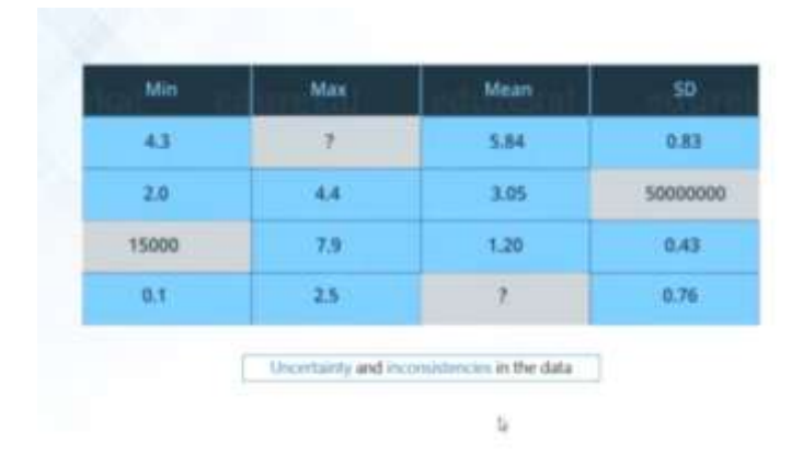
Fig -6: Veracity of Big Data

International Research Journal of Engineering and Technology (IRJET) e-ISSN: 2395-0056 RIET Volume: 06 Issue: 03 | Mar 2019 www.irjet.net p-ISSN: 2395-0072