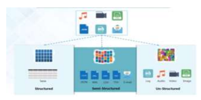
Fig -3: Variety of Big Data.

There are different forms of Data. Each of these are very dissimilar from each other. This data isn't the old rows and columns and database connections of our forefathers. It's very different from application to application, and ample of it is unstructured. That means it doesn't simply fit into fields on a spreadsheet or a database application.