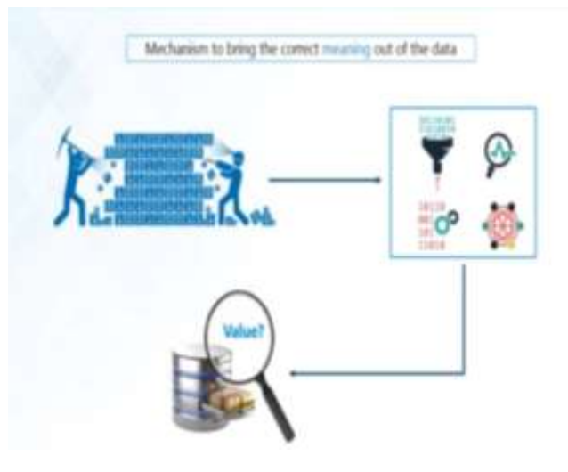
Fig -5: Value of Big Data

When we talk about value, we're discussing to the worth of the data being extracted. Having boundless amounts of data is one thing, but if it can't be turned into value it is useless. While there is a clear link amongst data and insights, this does not constantly mean there is value in Big Data. at numbers