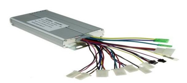
Fig 3 -MICROCONTROLLER

Microcontroller Designed for 48 Volt electric bike up to 500 Watts. Maximum current 20 Amps. Current limiting feature helps prevent controller and motor damage due to over-current conditions. Under voltage protection feature helps prevent over-discharge and extends battery life. When the battery pack falls below a specific Voltage the controller turns the motor off preventing over discharging of the battery pack which extends the battery packs lifespan.