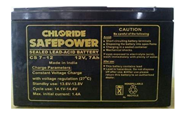
Fig 4- BATTERY

Here lead acid battery have been used .According to calculation 48v 20a battery is chosen