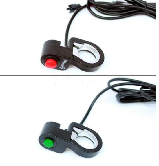
Fig 4 – switch

Here two switches are use to set and reset the cruisecontrol