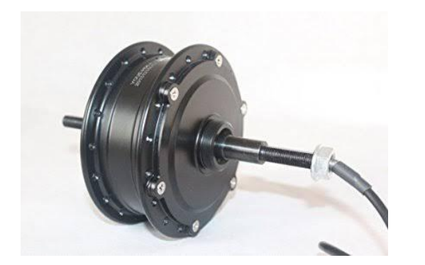
Fig 2- Hub motor

This hub motor will be powered by 48V battery attached to the vehicle. The switch will be used to turn on and turn off the hub motor. The hub motor will be attached to the rear wheel by means of spoke assembly. The hub motor will be controlled by controller, which allows linear acceleration in start mode and provides normal speed at drive mode. This prevents the risk of losing control over the vehicle during acceleration.