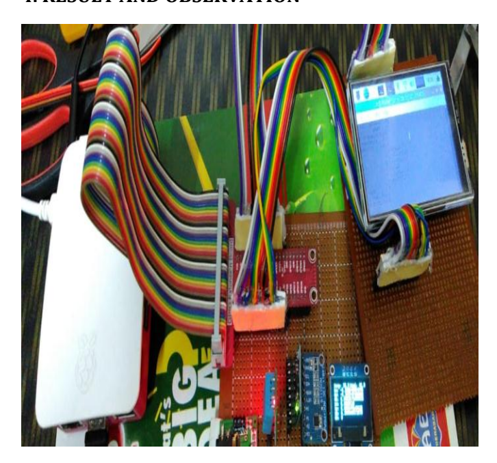
Fig1. Implemented board