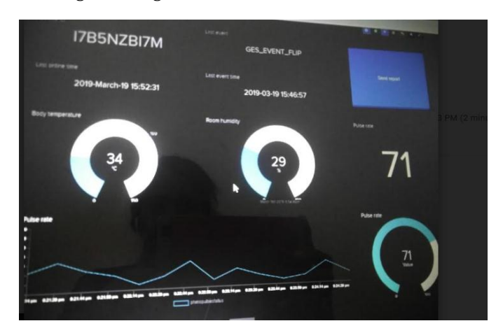
Fig4. Result on Dashboard