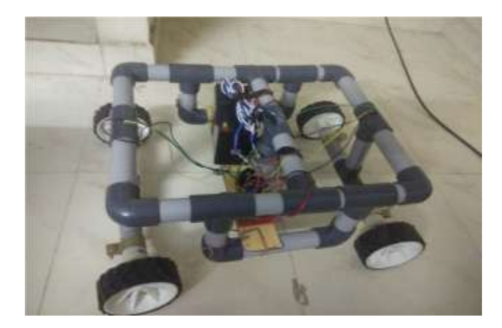
Fig-3: Overall hardware kit

The lawn mower project is designed to reduce the time and manual labour required for lawn clearing. The use of physics and AI helps by increasing the potency of the work done. The use of RF Module makes this lawn mower more pollution free and cost effective. The concept of controlling the lawn mower by RF Module solves the requirement of man's presence near the mowing site. The smart lawn mower design is achieved minimum working time, minimize the price, minimum energy consumption, and mixed operation mode. In future a grass assortment box may be mounted.