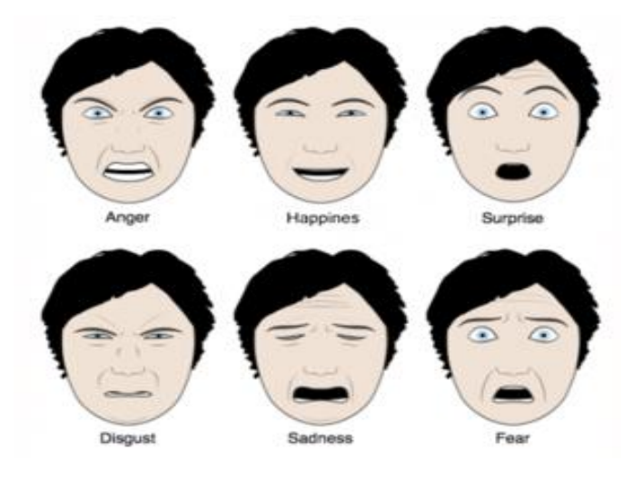
Fig. 2: Six basic facial expressions.