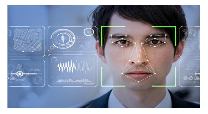
Fig.1: Characteristic points on the face.

A set of characteristic points of the face registered in 2D space is shown in Fig. 1.