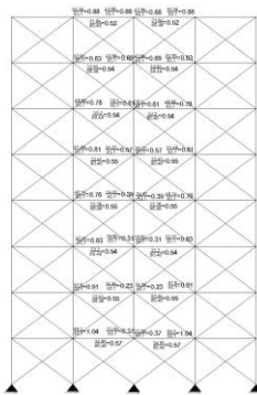
Fig -6: DCR for Case1with bracing system