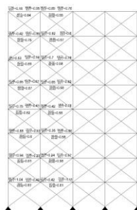
Fig -8: DCR for Case1with bracing system