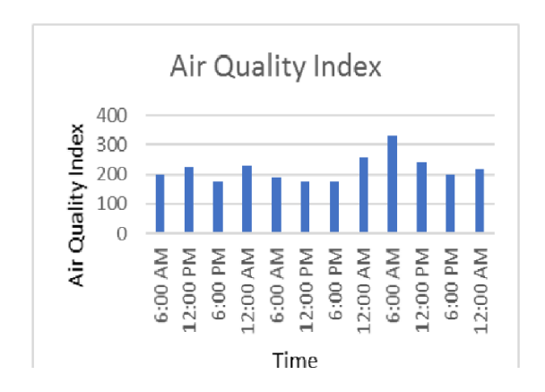
Fig-7 air quality index at an urban region

Volume: 06 Issue: 03 | Mar 2019 www.irjet.net p-ISSN: 2395-0072