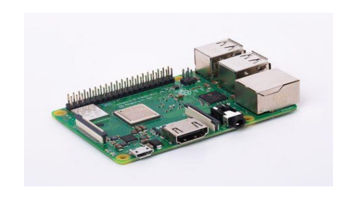
Fig-1 Raspberry pi

Raspberry pi 3b module is used which has an arm based single board computer which has a Wi-Fi and Bluetooth module already present in it. This controller is connected with the necessary sensor modules and GSM module .using these system we can acquire data and send it over the internet to a Cloud based storage area. The raspberry pi has the advantage of faster processing and better compatibility.