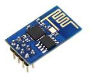
Fig. Wi-Fi Module

Note: The ESP8266 Module is not capable of 5-3V logic shifting and will require an external Logic Level Converter. Please do not power it directly from your 5V dev. board.