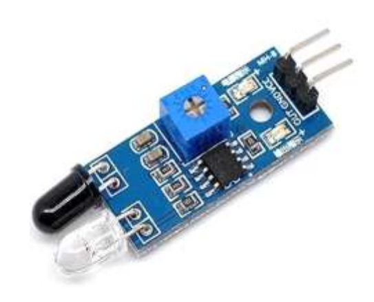
Fig. IR Sensor