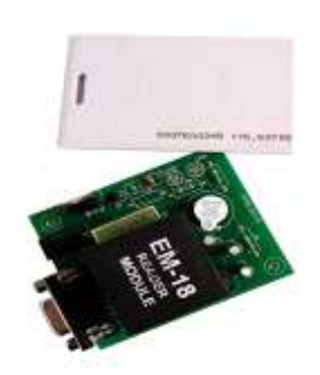
Fig. RFID Reader And Tags

Radio-frequency identification (RFID) uses electromagnetic fields to automatically identify and track tags attached to objects. The tags contain electronically-stored information. Passive tags collect energy from a nearby RFID reader's interrogating Unlike a barcode, the tag need not be within the line of sight of the reader, so it may be embedded in the tracked object. RFID is one method of (AIDC). A passive tag is cheaper and smaller because it has no battery; instead, the tag uses the radio energy transmitted by the reader. However, to operate a passive tag, it must be illuminated with a power level roughly a thousand times stronger than for signal transmission.