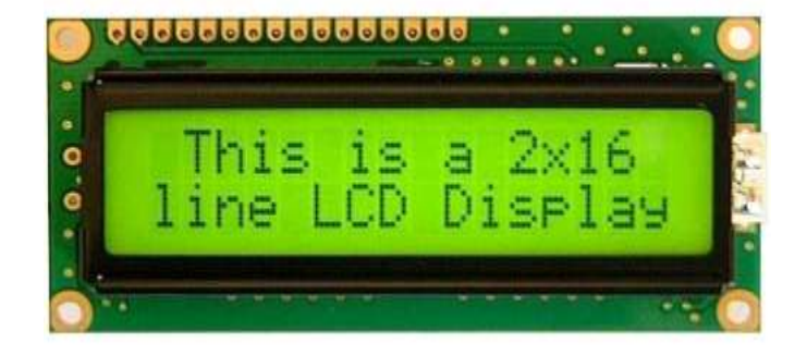
Fig. LCD Display

There are various display devices such as seven segment display, LCD display, etc. that can be interfaced with microcontroller to read the output directly. In our project we use a two line LCD display with 16 characters each.