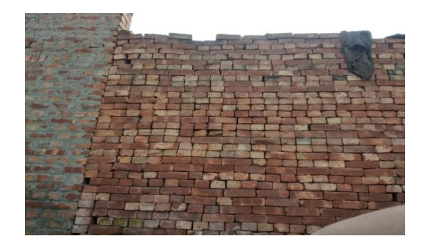
Fig 3- Brick wall with no mortar

Rural people do not understand the weightage of brick bonds and filling of joints with mortar, as shown in the photographs given below. :