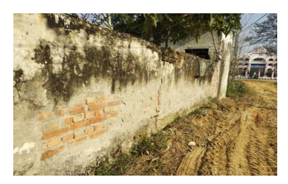
Fig 6- Plaster Decay

Most of the rural people finish the wall with rendering from inside and external portion is left exposed to weather. However, making external portion waterproof is more essential. On the other hand, they use very fine or silty sand in the plastering, which provides very smooth finishing in the beginning but later on it deteriorates very fast, as shown in the photograph.: