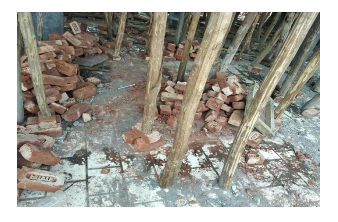
Fig 2- Loose brick support

It shows that there is no vertical alignment of the vertical members and only temporary loose brick supports are provided at base.