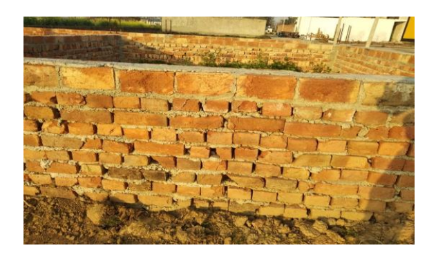
Fig 5- Wall with bonding cracks

Such kinds of structures are venerable for earthquakes, flood and other natural calamities, which may cause fatal accidents. They have no facilities for testing the quality of bricks such as, crushing strength, water absorption and efflorescence etc.