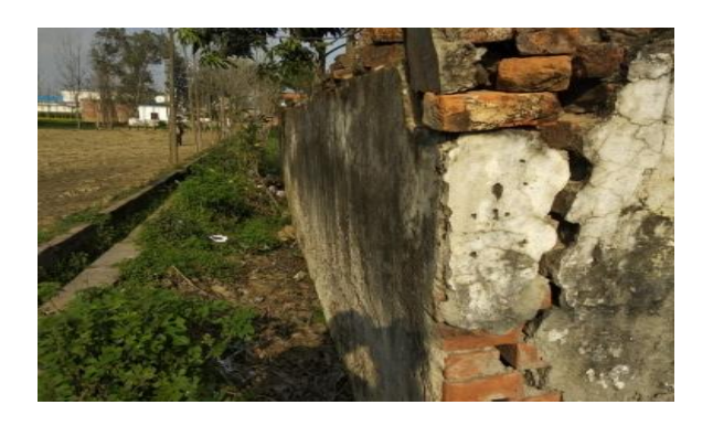
Fig 4- Wall with empty joints