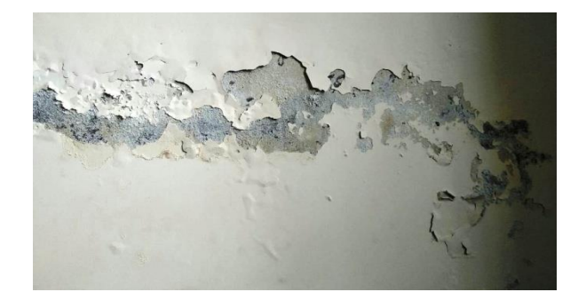
Fig 6- Moisture Patches on wall

All structures should be water tight, because structures with dampness are not only harmful for structures itself but it spoils stored material and badly affects the health of human and animals. The reason behind it is the negligence in workmanship during construction and selection of improper specifications and techniques.