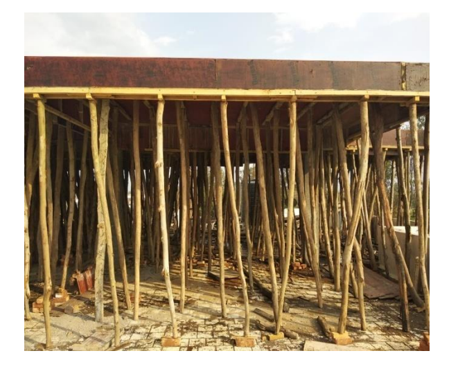
Fig 1-Form Work

They provide traditional form work with wooden planks, batons and wooden logs (ballies) etc., which are not designed as per loading conditions. Photograph of such formwork is shown below.: