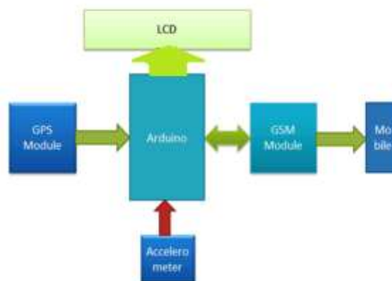
Fig.1: Block diagram of Accident detection and alerting system

In this project, Arduino is used for controlling whole the process with a GPS Receiver and GSM module. GPS Receiver is used for detecting coordinates of the vehicle, GSM module is used for sending the alert SMS with the coordinates and the link to Google Map. Accelerometer namely ADXL335 is used for detecting accident or sudden change in any axis. And an optional 16x2 LCD is also used for displaying status messages or coordinates. We have used GPS Module SIM28ML and GSM Module SIM900A.