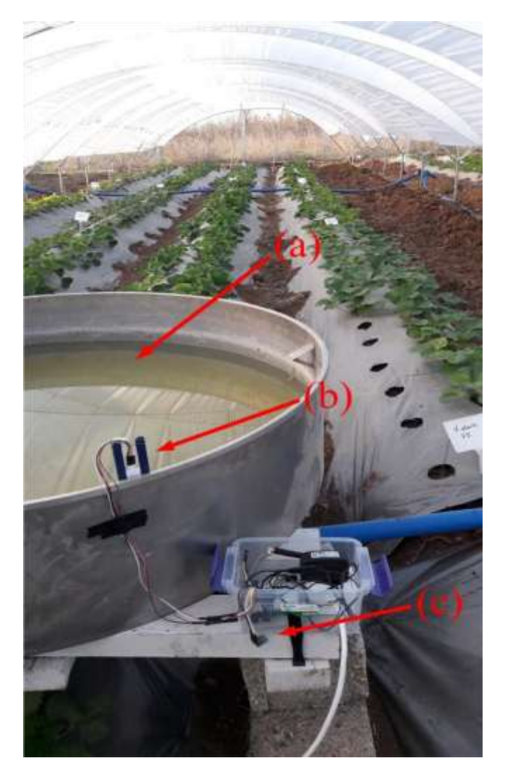
Fig. 3. Data gathering unit inside the greenhouse. (a) Evaporation pan, (b) Water level sensor, and (c) Environmental sensor. Most excellent quantity of water for pleasant crop exceptional truely makes contribution to modest water consumption on this planet.

an automated irrigation gadget based on microcontrollers linked to a cloud provider is defined and its utility to a strawberry area is proven right here. Whilst in comparison to its opposite numbers, our gadget has a few novel functions. Initially, the foremost amount of water required for irrigation is routinely computed. This computation is primarily based on the water stage decrement at a positive amount of time inside the evaporation pan. Usage of choicest water quantity prevents the vegetation from now not most effective drought pressure, but also the over-watering associated fungal and bacterial sicknesses. Besides, this device has an accompanying Android application which makes it possible to remotely check the present day gadget repute. With this system, possibility of human-related mistakes as well as reserved hard work time for irrigation project are minimized. Furthermore, usage of