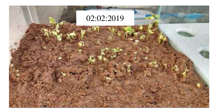
Fig-6 Growing stage 1

The observations are done from the initial stage to growing stage. This behaviour observations done for both aquaculture and hydroponics system. The plant growth observed certain interval of days.