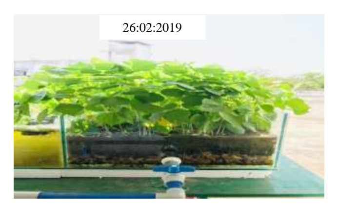
Fig -8 Growing stage 3