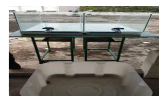
Fig - 2 Initial set up