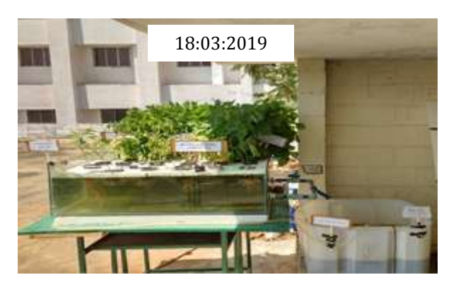
Fig -10 Growing stage 5