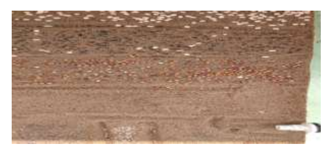
Fig -4 Sowing of seeds for media based system

In media based system pulses seeds, tomato and cabbage are decided for sowing process. The plantation bed is divided into two segments one for deep water culture and another one for media based system. To held sowing process for hydroponics system net pots are adopted to support the saplings on hydroponics bed.