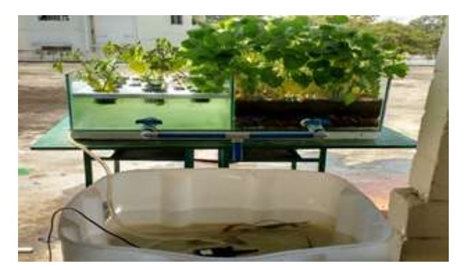
Fig -3 Final set up