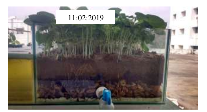
Fig -7 Growing stage 2