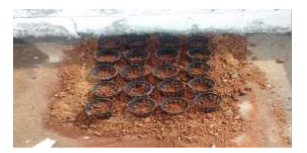
Fig -5 Sowing seeds for deep water culture

This filled medium used for initial grow for seed for saplings. After that expanded polystyrene used as a bed for hydroponics. On this expanded polystyrene bed holes are made to place the net pots with saplings. During this placing process filled materials are removed from net pots and the cleared plant with roots are placed.